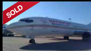
1994 B737-400 s/n 26530 PAX-TO-CARGO Status: Completed