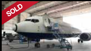
1993 B737-400 Status: C Check/Conversion Ongoing