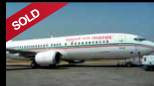
1990 B737-400 s/n 24808 PAX-TO-CARGO Status: Completed