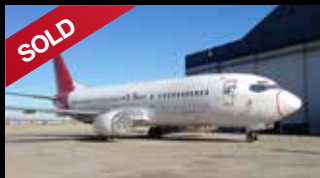
1996 B737-400 s/n 28151 PAX-TO-CARGO Status: Near Completion

Client locations: Middle East, Asia, European Union, and South America