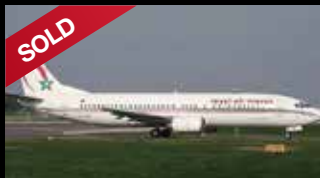
1994 B737-400 s/n 26529 PAX-TO-CARGO Status: Completed