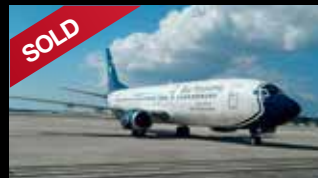
1994 B737-400 s/n 26298 PAX-TO-CARGO Status: Completed