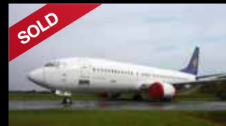
1991 B737-400 PAX s/n 24906 PAX-TO-CARGO Status: Completed