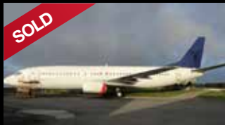
1991 B737-400 PAX s/n 24912 PAX-TO-CARGO Status: Completed