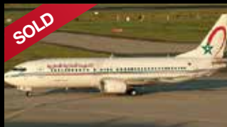
1992 B737-400 s/n 26526 PAX-TO-CARGO Status: Completed