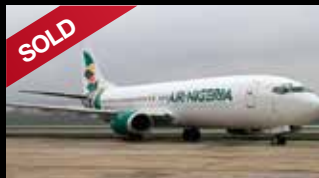
1994 B737-400 s/n 25375 PAX-TO-CARGO Status: Completed